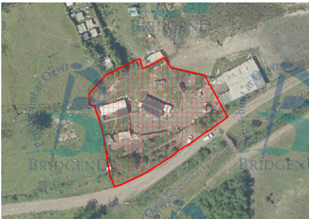
Extract from OS Base Map of Application Site