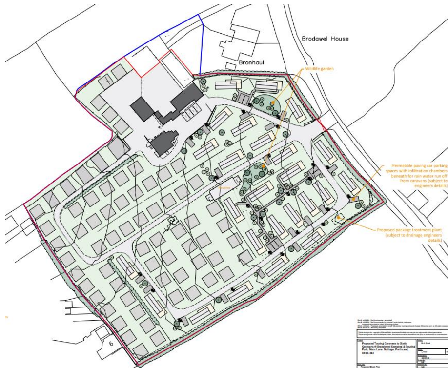
Figure 2 – Proposed Site Layout

The proposed static caravans will measure approximately 11m x 4m with a pitched roof and an overall height of 3.8m. Each caravan will comprise of three bedrooms, kitchen/dining area and w/c with shower. The wheels will be supported by concrete block piers and axle stands and will be covered by a continuous timber skirting. There will be a decked area erected around part of the caravan which will measure approximately 7.7m x 4.5m with a wooden balustrade to a height of 1.5m.