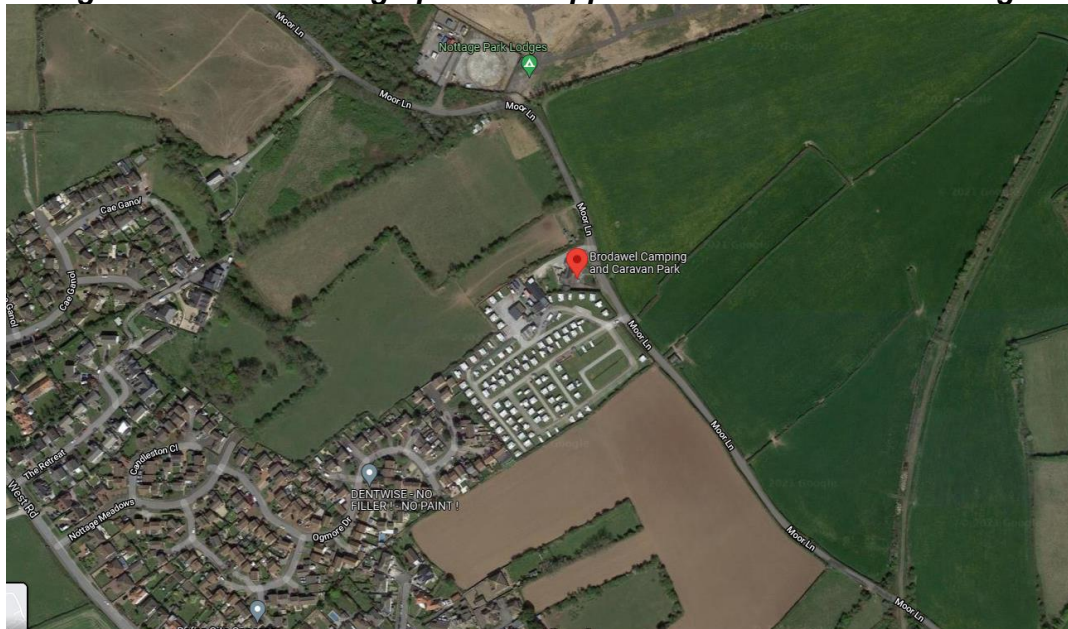
Figure 1 – Aerial Photograph of the Application Site and Surroundings

Initially the application proposed the change of use of 125 touring caravans to 50 static caravans with associated infrastructure improvements and ecological mitigations and enhancement. Following a number of concerns raised by the Local Planning Authority (LPA) regarding the loss of touring pitches at the site and highway safety concerns, an amended scheme was submitted on 10 May 2021 which proposed the change of 25 touring caravans to 25 static caravans and the retention of 68 touring pitches with a revised Transportation Statement for the site submitted on 2 September 2021.