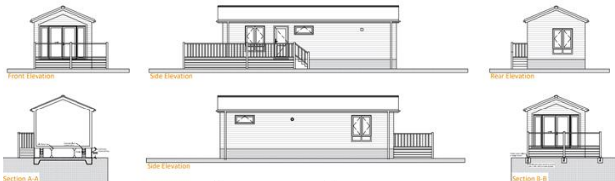
Figure 3 – Proposed Elevations and Floor Plans of the Static Caravan:

The proposed static caravans will measure approximately 11m x 4m with a pitched roof and an overall height of 3.8m. Each caravan will comprise of three bedrooms, kitchen/dining area and w/c with shower. The wheels will be supported by concrete block piers and axle stands and will be covered by a continuous timber skirting. There will be a decked area erected around part of the caravan which will measure approximately 7.7m x 4.5m with a wooden balustrade to a height of 1.5m.