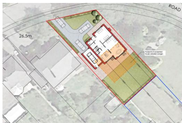
Fig. 4: Proposed Site Layout Plan

In terms of its position within the site, the proposed dwelling is set back from the defined building line along Bowham Avenue, as well as being set behind 1 Glanogwr Road, both of which are located to the west of the application site. As a result, the new dwelling will project beyond the rear elevation of no. 1 Glanogwr Road, as shown in the site plan extract below: