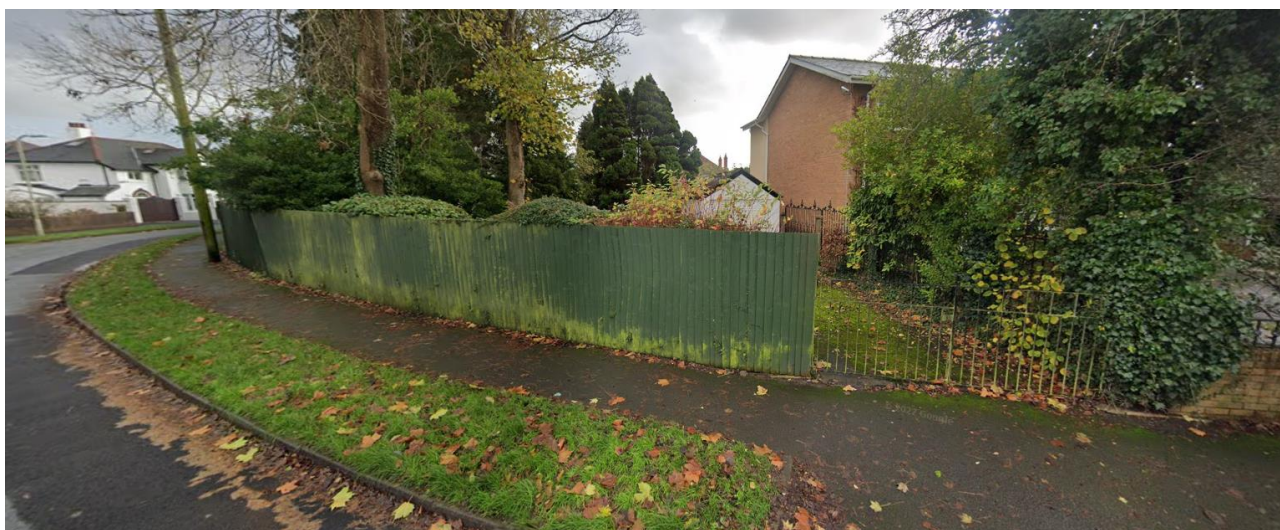
Fig. 2: Street View image of the application site

The application site is situated within the Primary Key Settlement of Bridgend, as defined by Policy PLA1 of the Local Development Plan (2013). It forms part of the rear garden of 82 Merthyr Mawr Road, with the northern boundary of the site formed by Glanogwr Road.