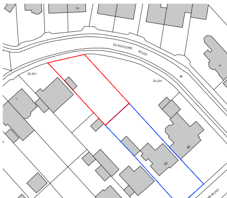
Fig. 3: Site Location Plan

The application site and its relationship to residential dwellings bordering the site is shown below: