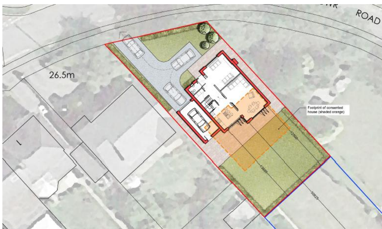
Fig. 1: Proposed Site Layout Plan

The proposed layout comprises a detached dwelling with an area of garden space and a driveway to its front, which will be accessed from Glanogwr Road. The proposed dwelling will also benefit from garden space to its rear.