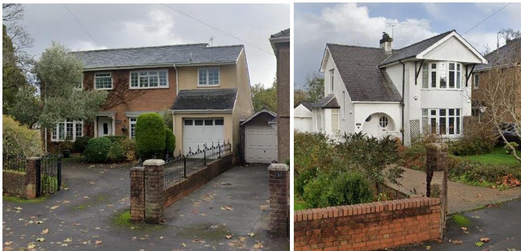
Images of 1 Glanogwr Road and 18 Glanogwr Road

The proposed dwelling is of an individual design, which doesn't aim to match the design characteristics of the surrounding properties, the vast majority of which are hipped roof semi-detached dwellings. Similar examples of individually designed dwellings include 1 Glanogwr Road, sitting immediately to the west of the site, as well as 18 Glanogwr Road, which sits immediately opposite the site, to the north-west.