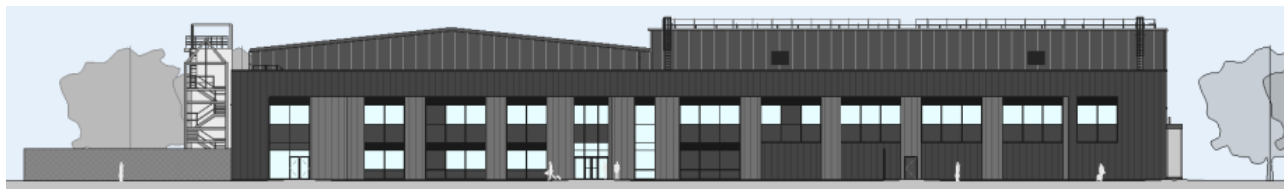
Proposed northern elevation

The proposed building will provide 12,835m 2 of gross internal floor area across two floors, measuring a maximum of 87m in width and 136m in depth. To the north, the building will measure approximately 10m in height and includes a flat roof, with warehouse style buildings to the south of this measuring a maximum 14m in height and including both pitched roof and flat roof elements.