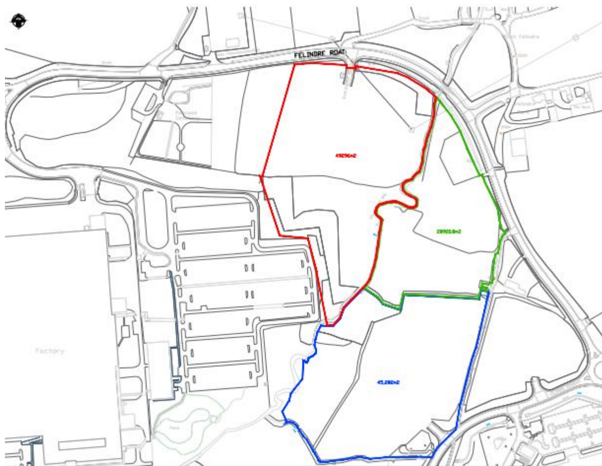
Site location plan – extent of application site within the boundaries of BCBC shown in red

The Ewenni Fach river runs through the centre of the site and forms the administrative boundary between BCBC and RCTCBC. As such, the application relates to land which falls under the jurisdiction of two separate authorities, with a separate planning application having been submitted to RCTCBC.