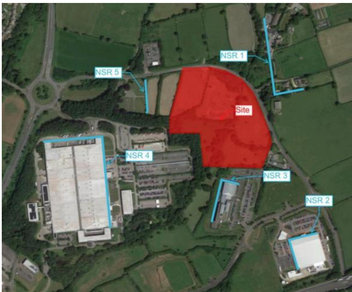
Worst-affected noise sensitive receivers

The Noise Impact Assessment identifies the closest noise sensitive receivers (NSR) as comprising the residential dwellings to the north-east of the site, the office buildings to the south and the south-west of the site, and Pencoed Cemetery, which is situated to the west of the site. The report assesses the impact of the noise from the mechanical plant and the use of firearms within the site on these NSR through the use of noise modelling, taking into account the existing background noise levels.