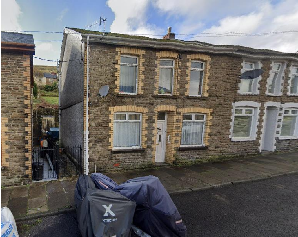
Fig. 2: Steet View of Property

The site is situated in a residential area characterised largely by semi-detached and terraced properties. The application site is bounded by a rear lane to the west which serves the rear of the properties on Walters Road, Park Avenue and Bryn Road. The property is finished in stone and brickwork to its elevations and has a tiled roof with white UPVC windows and doors. A side access to the garden of the property is located to the south of the dwelling house.